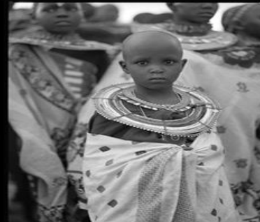
YOUNG MAASAI GIRL - AMBOSELI, KENYA (#3) 20x24 Framed : STARTING BID: $750