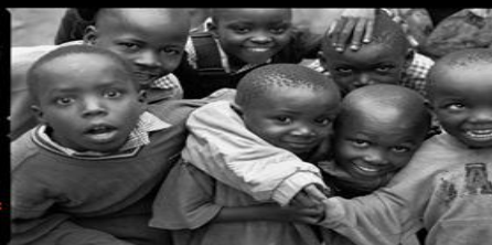
CHILDREN IN THE SLUMS OF NAIROBI, KENYA (#10) 11 x14 Framed : STARTING BID: $500