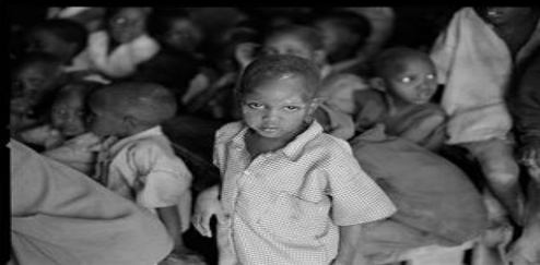
MAASAI BOY - AMBOSELI, KENYA (#9) 20x24 Framed: STARTING BID : $750