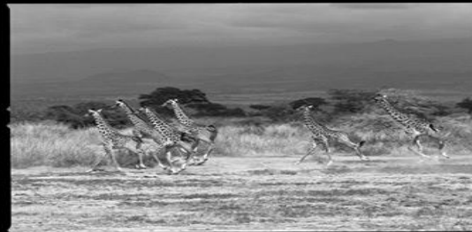
6 GIRAFFE RUNNING- AMBOSELI, KENYA (#7) 8 x 10 Deluxe Framed : STARTING BID : $500