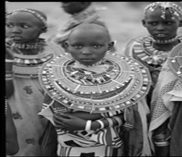
MAASAI GIRL IN AMBOSELI, KENYA (#2) 11"x14" Deluxe Frame : STARTING BID: $600