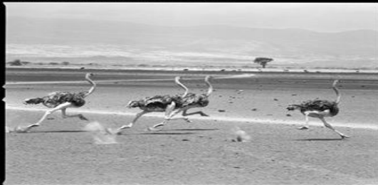
OSTRICH RUNNING 40 MPH - AMBOSELI, KENYA (#5) 11 x 14 Framed : STARTING BID : $500