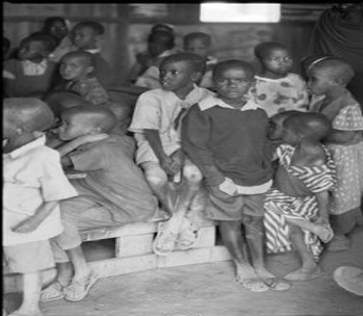
MAASAI SCHOOL CHILDREN - AMBOSELI, KENYA (#8) 20 x24 Framed : STARTING BID: $750