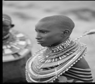
MAASAI GIRL IN NAIROBI, KENYA (#1) 20"x24" Framed : STARTING BID: $750