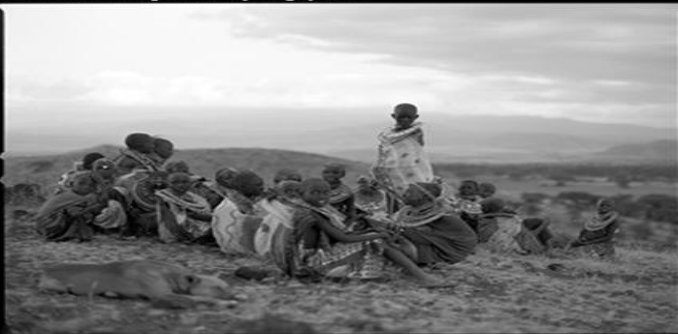
MAASAI GIRLS - AMBOSELI, KENYA (#4) 11x14 Deluxe Framed : STARTING BID: $600