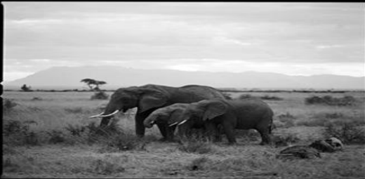
ELEPHANTS- AMBOSELI, KENYA (#6) 11 x 14 Framed : STARTING BID : $500